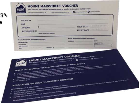
Mount Mainstreet Voucher

We understand that not all POS systems can support this type of voucher, please let us know if you are unable to accept these vouchers. These vouchers can only be redeemed at participating member businesses, vouchers are not transferable for cash and must be redeemed prior to the expiry date.